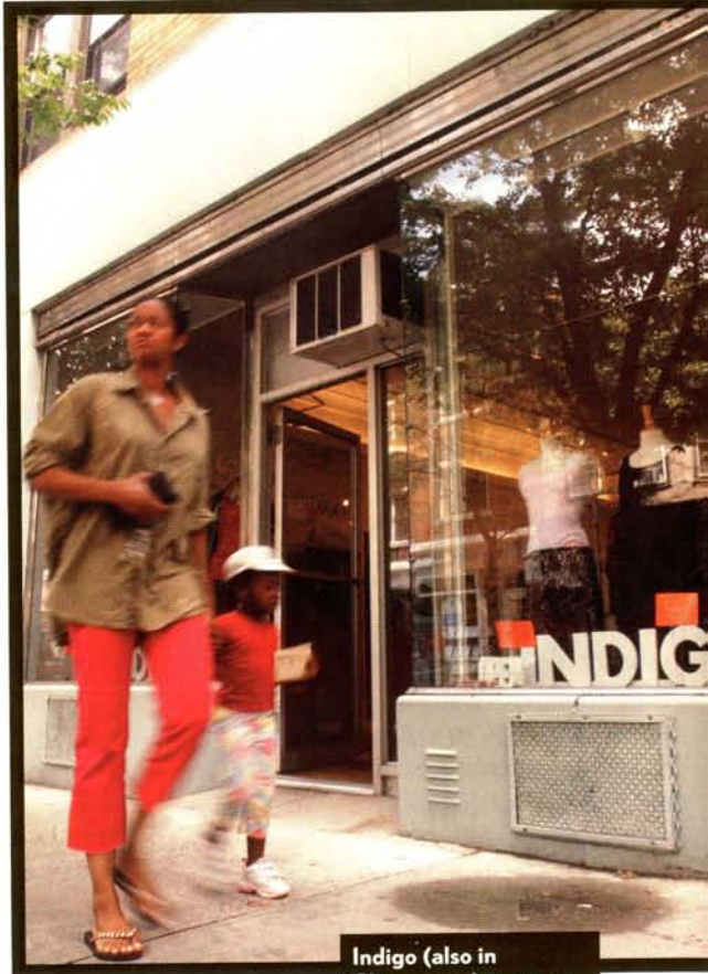
Retro clothes and accessories abound at Chelsea's—for moms, 'tweens and toddlers, too